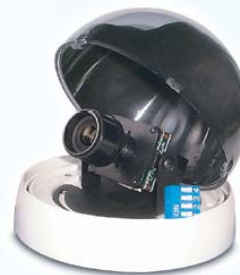
MS-C B x46xxE