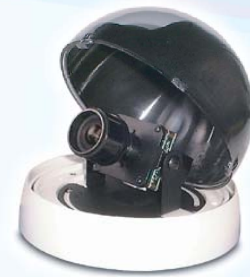
MS-C B x46xxE